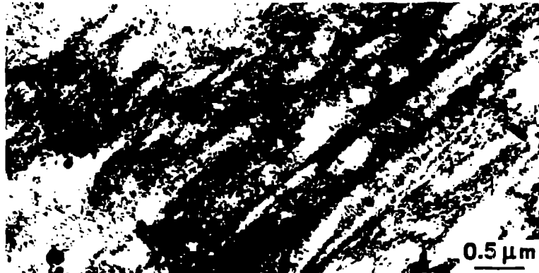
FIGURE 3 TEM micrograph of 6061-T6 Al shocked to 13 GPa showing microbands.